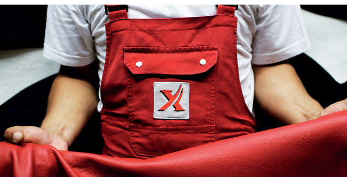
LEATHER - MANUFACTURING