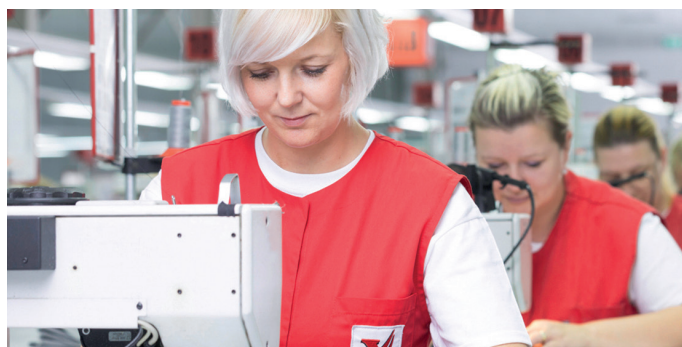
LEATHER - PROCESSING