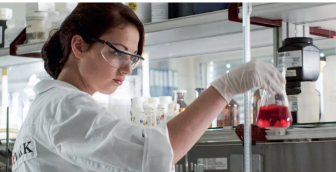
RESEARCH & DEVELOPMENT