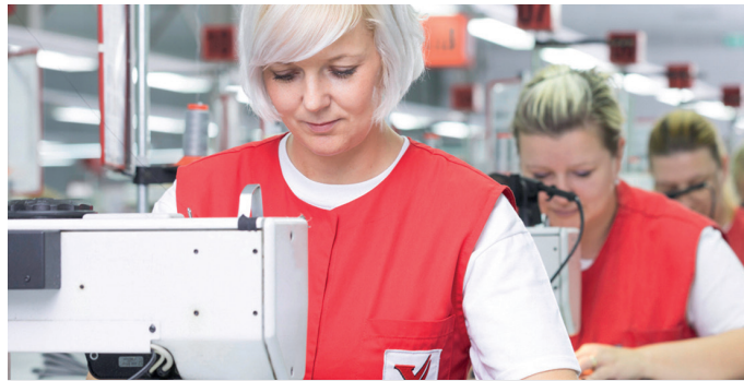
LEATHER - PROCESSING