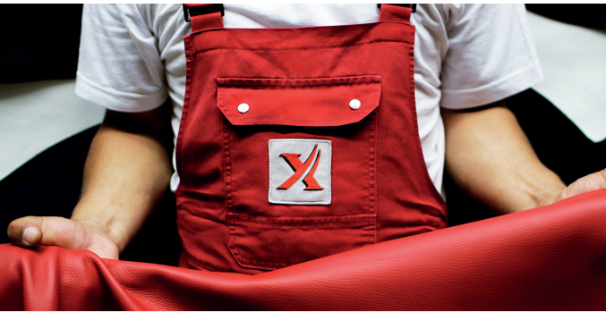
LEATHER - MANUFACTURING